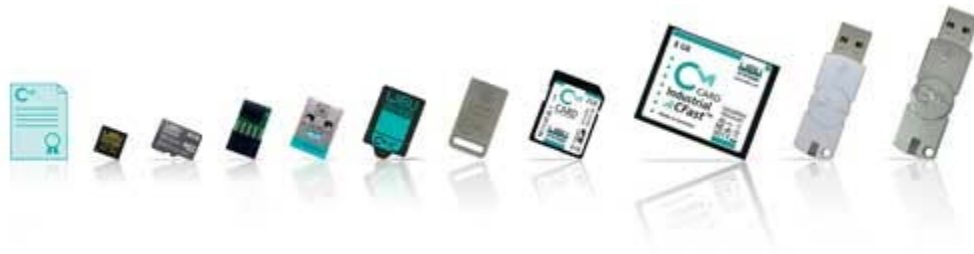
Photo Caption: CodeMeter medical device security and licensing technology safeguards connected intelligent medical devices and embedded systems against the many potential vulnerabilities and security threats prevalent in today's digital age.

Company executives will be on hand for product demonstrations and discussion at the Wibu-Systems booth in Hall E, Booth 976, German Pavilion.