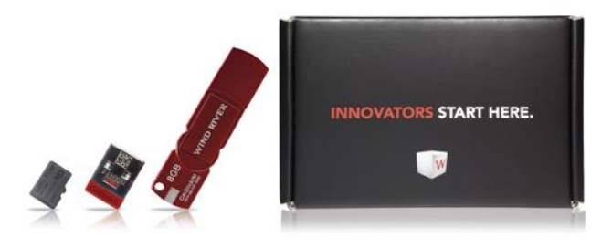
Picture 2: CodeMeter Security includes the protection hardware CmDongles.